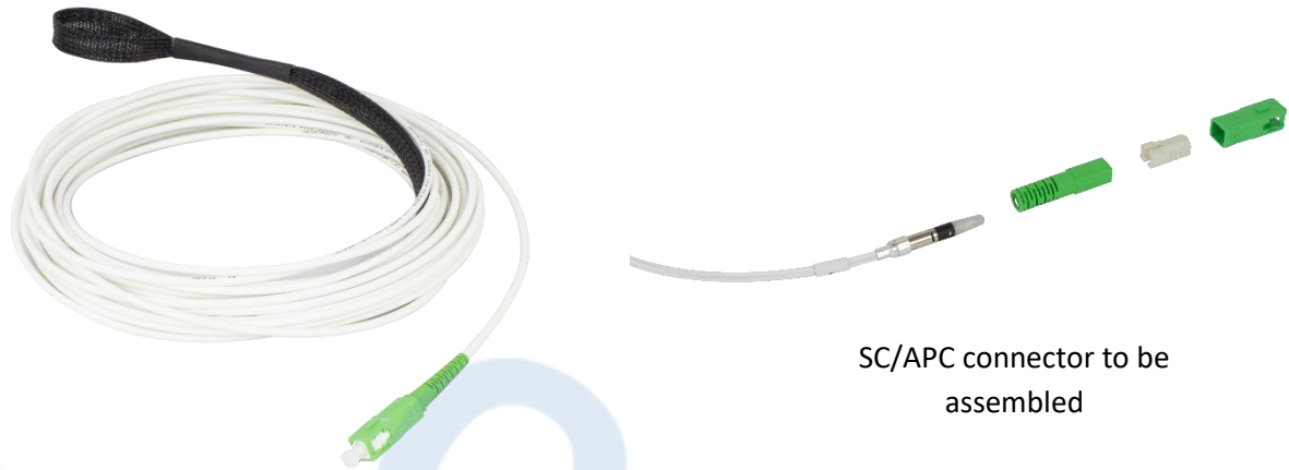
SC/APC connector to be assembled

Description 9/125 G.657.A2 single-fiber cable, LSZH jacket, Cca, preterminated with SC/APC connectors