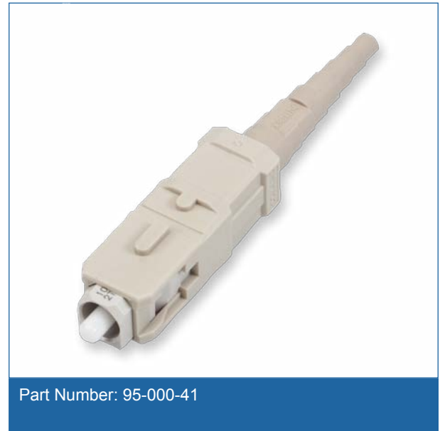
Part Number: 95-000-41

Corning Cable Systems UniCam® High-Performance Connectors offer best-in-class optical performance in a fast, easy field-termination solution. These high-precision connectors guarantee exceptional insert loss – 0.1 dB typical/0.5 dB maximum per connector pair for multi-mode, 0.2 dB typical/0.5 dB maximum per connector pair for single-mode. Installation of an LC, SC, or ST® Compatible Connector can be accomplished in about 45 seconds with the UniCam High-Performance Tool Kit. The lightweight, handheld installation tool and the high-performance cleaver virtually eliminate human variability from installation, ensuring terminations are right, the first time, every time. This kit was designed with consideration for the network installers, from the cleaver, with its integrated fiber scrap bin and dual-clamp precision hold, to the installation tool, with its immediate go/no-go feedback signal. Installation is as easy as strip, clean, cleave, cam and crimp, with exceptional optical performance guaranteed. Every UniCam Connector is guaranteed to meet the published specification at the time of installation or Corning Cable Systems will replace it.