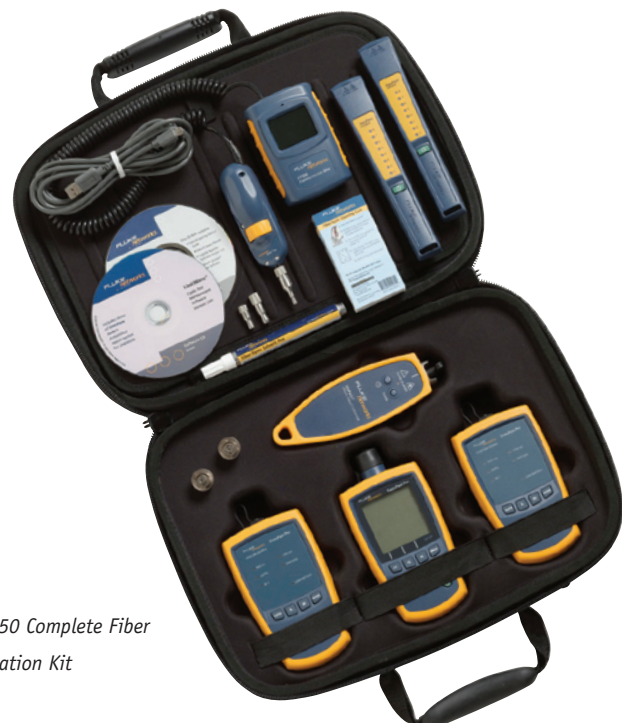
FKT1450 Complete Fiber Verification Kit